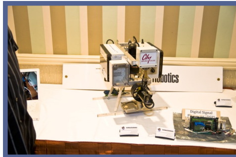
City College displayed their robotics project at the January AFCEA San Diego luncheon.