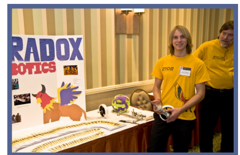
A student from San Dieguito Academy High poses with their robotics project at the January AFCEA San Diego luncheon.